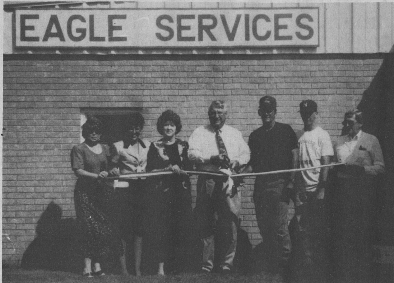
Eagle Services cuts ribbon

Customers who have questions concerning hurricane precautions may call their local Entex office.